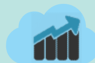
CRM / Sales / Distribution