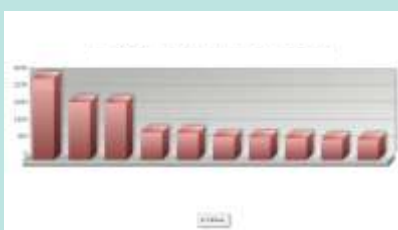
Sales Order Account Yearly