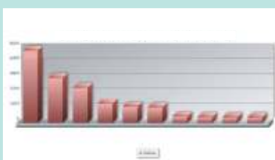
Purchase Order Account Yearly