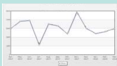
Sales Yearly Graph