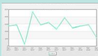
Purchase Order Graph