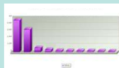
Purchase Order Account Monthly