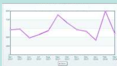
Sales Order Graph